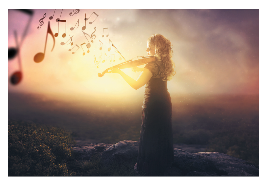
"Make a decision that this year you will praise God in a more vocal, uninhibited way than ever before."