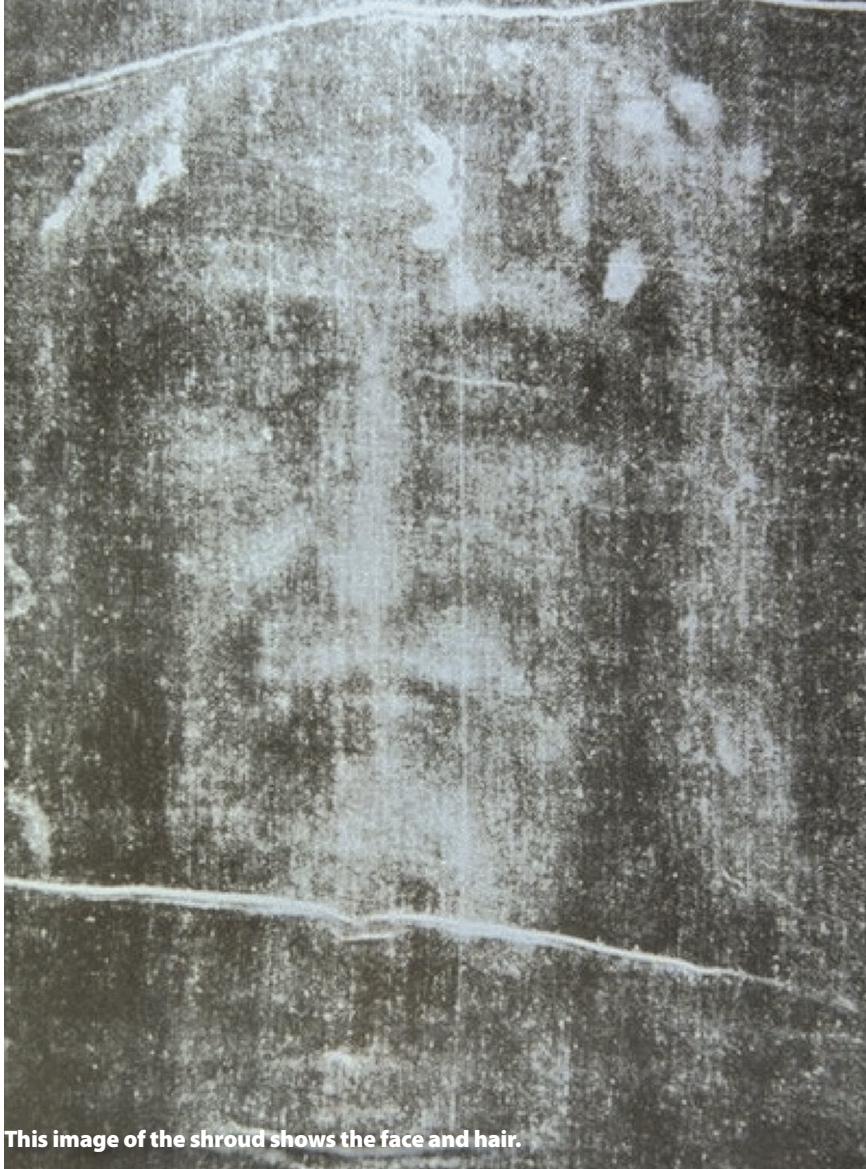
This image of the shroud shows the face and hair.

done, I was determined to understand and share the complete story of the shroud, including a proper biblical perspective. I was totally unprepared not only for what I would learn from Scripture that points to the shroud and removes the stigma associated with relics, but also that the Lord has a hidden purpose for the shroud, a prophetic purpose whose time has come.