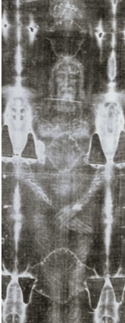
This part of the shroud reveals the legs were not broken.